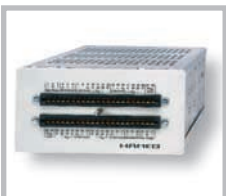
Test adapter HZ809

Mainframe HM8001-2 required for operation